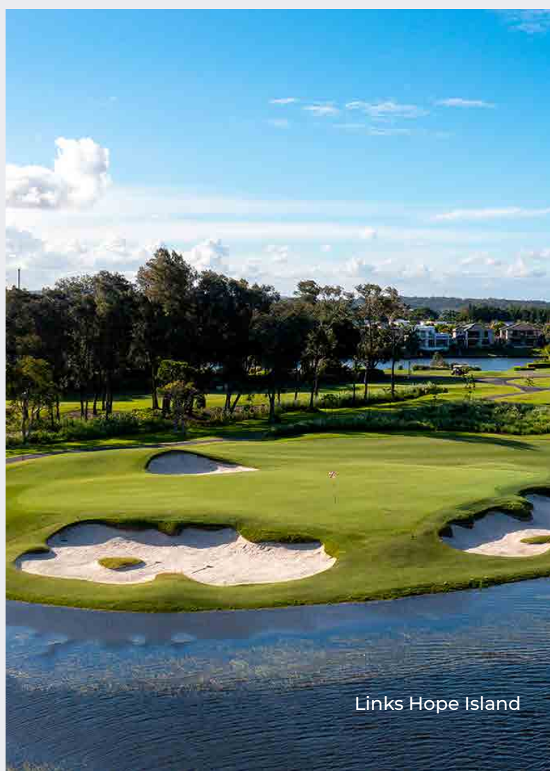
Links Hope Island