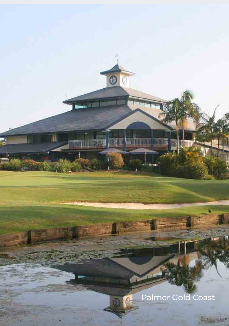
Palmer Gold Coast