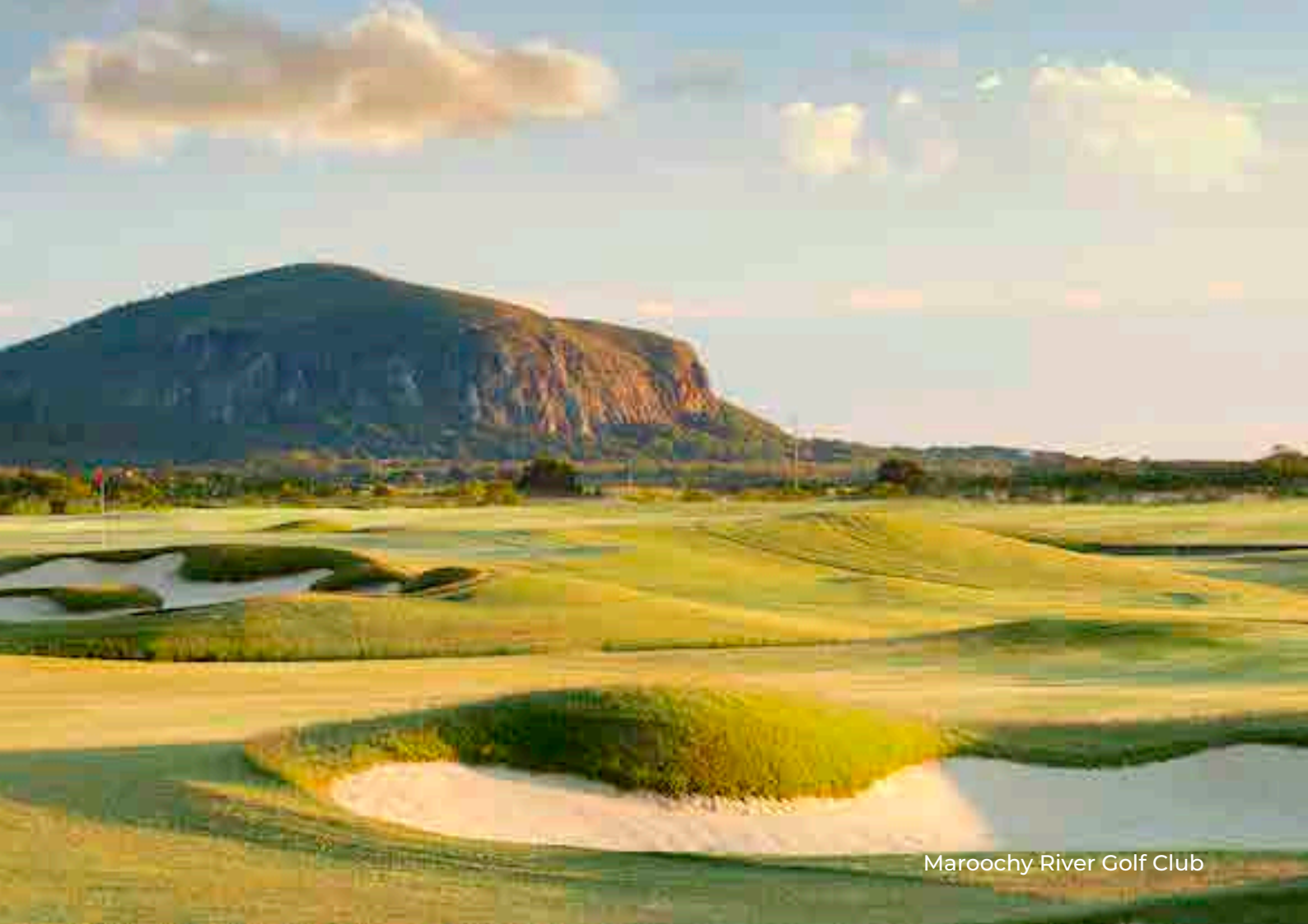
Maroochy River Golf Club