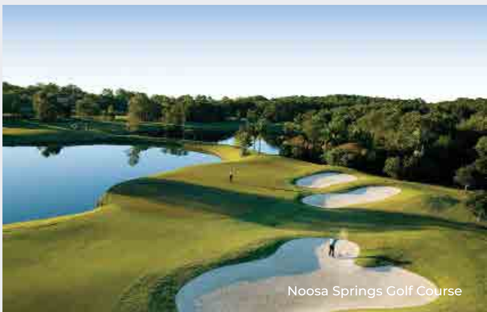
Noosa Springs Golf Course