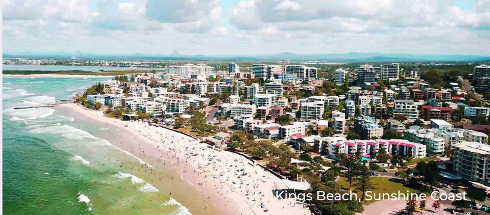
Kings Beach, Sunshine Coast