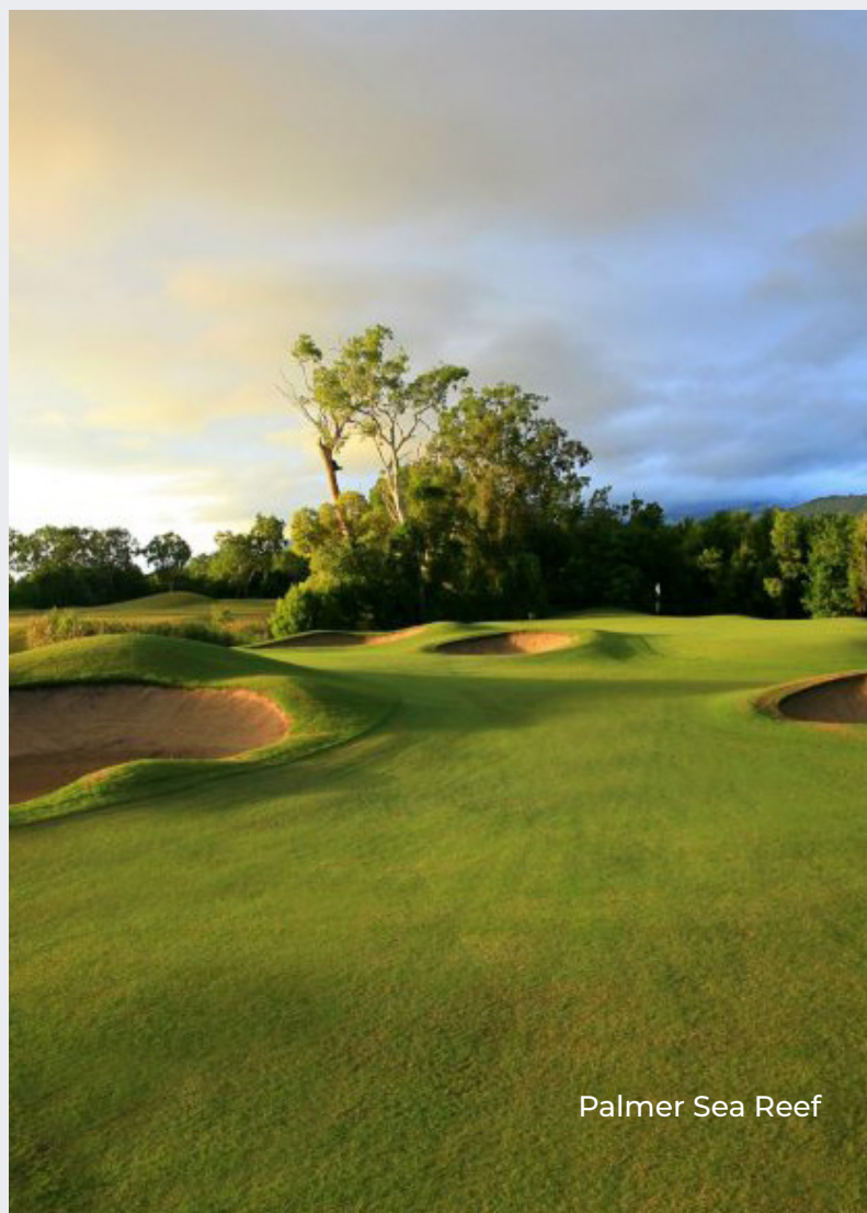
Palmer Sea Reef