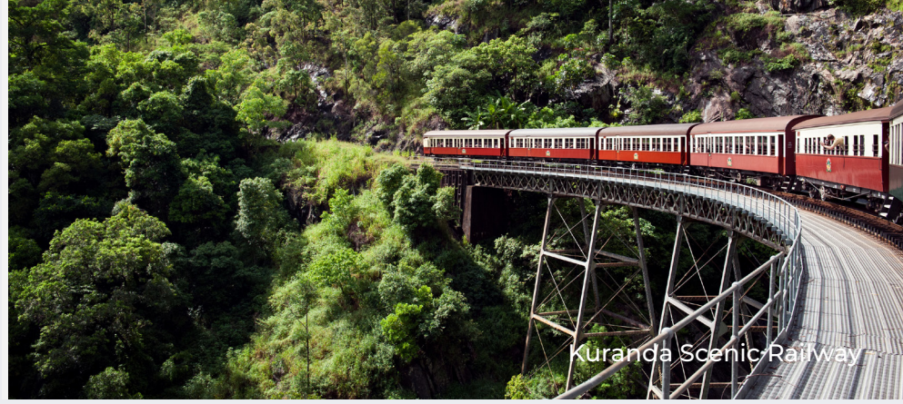
Kuranda Scenic Railway