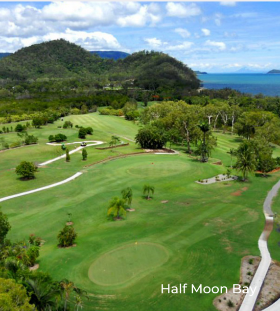
Half Moon Bay