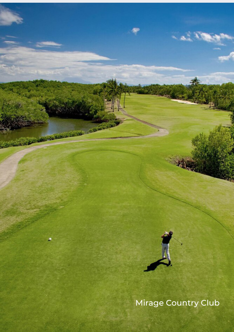
Mirage Country Club